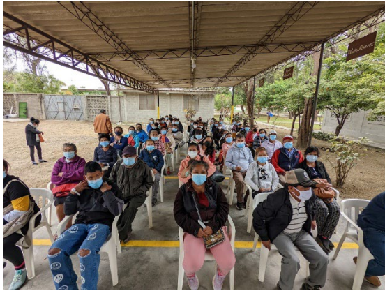
Patients at Centro Pastoral waiting patiently to be seen by providers.