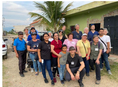
The 2022 May Guatemala Team