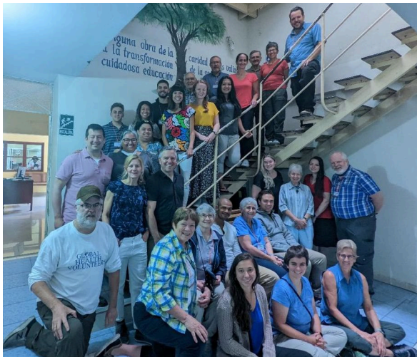
The 2022 June Peru Team