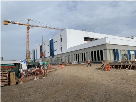
Outside view of the construction at Hospital Chulucanas in June 2022