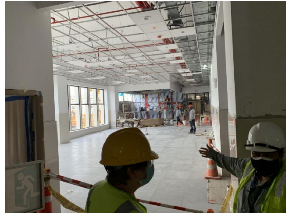
The inside of Chulucanas hospital that has been delayed due to supply chain issues.

Due to supply chain delays in the construction for the Chulucanas Hospital that was scheduled to open in June, GHM is unable to conduct the surgical portion of the Peru October mission. We will still be conducting a small Sierra team mission (all positions have been filled) during the first scheduled week of the mission. It is with much disappointment to both GHM and the patients who have been waiting for much needed surgeries since before the pandemic. We are hopeful that the hospital will be fully equipped and furnished by June of 2023.